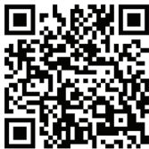
Innovation continues in 2025

In 2025, we will continue to rapidly execute our 21st Century Security vision to build a more advanced, resilient and interoperable defense industrial base poised to meet the needs of our nation and its allies in an intensifying and complex geopolitical environment.